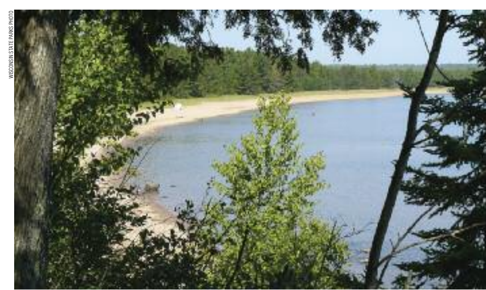
Big Bay State Park on Madeline Island.

The Brule River, a premier trout stream, drops 328 feet as it cascades from its headwaters to the shores of Lake Superior. Enjoy exciting whitewater canoeing, kayaking and fishing as well as wilderness solitude. 6250 S Ranger Rd, Brule 54820 715/372-5678