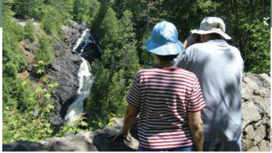
Pattison State Park, near Superior.