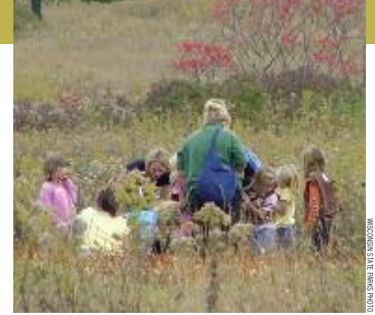
Nature Programs at Havenwoods State Forest.

More than 70 friends groups provide volunteer help and raise funds for state parks, forests, recreation areas and trails. A statewide organization, Friends of Wisconsin State Parks (fwsp.org) supports local friends groups and raises private funds for state park system enhancement and preservation.