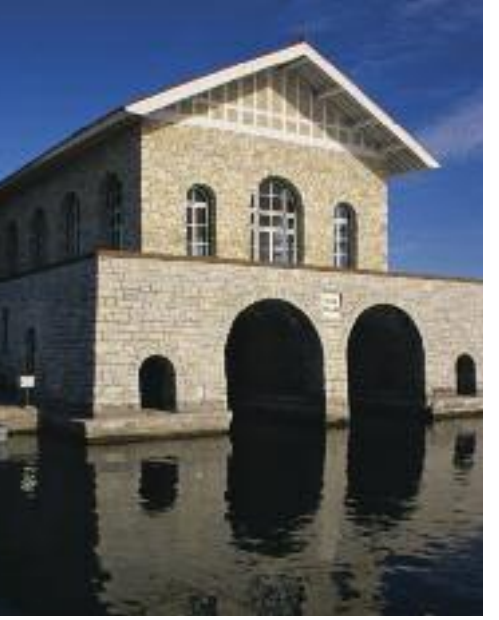
Rock Island State Park, near Washington Island.