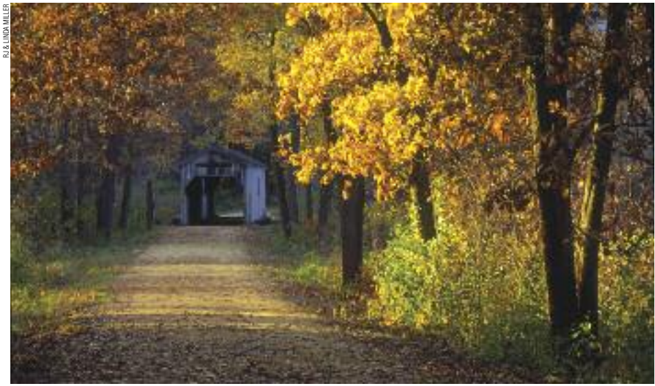
Sugar River State Trail, near New Glarus.

Running 17 miles through the picturesque Bonner Branch Valley, this county-operated trail links Belmont with Calamine and the 47-mile multi-use Cheese Country Trail. 1016 16th Ave, Monroe 53566 608/328-9430 🖾 🗲 🖾 层