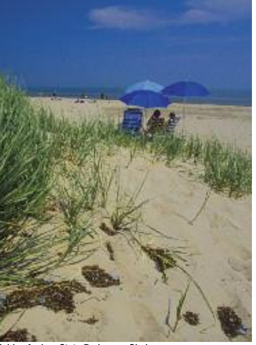
Kohler-Andrae State Park, near Sheboygan.

Part of the Ice Age National Scientific Reserve, this park offers a spectacular view of picturesque rock formations. Open Memorial Day through September. 15819 Funnel Rd, Camp Douglas 54618 608/427-6692, Off-season: 608/337-4775 🛆 🗟 🗮 🖾