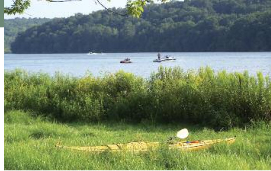
Yellowstone Lake State Park, near Blanchardville.