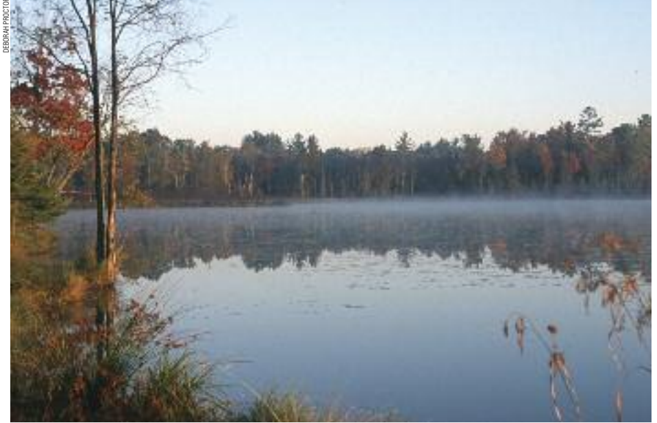
Interstate State Park, near St. Croix Falls.

More than 2,800 acres of woods, a picnic/beach area on Woods Lake, skiing and hiking trails. and 6 miles of shoreline on the Caldron Falls Flowage. Family campground opening later in 2011, N10008 Paust Lane, Crivitz 54114. 715/757-3979 📚 🖾 🗠 🐷 🕻 🕅 🐼