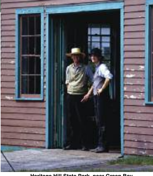
Heritage Hill State Park, near Green Bay,