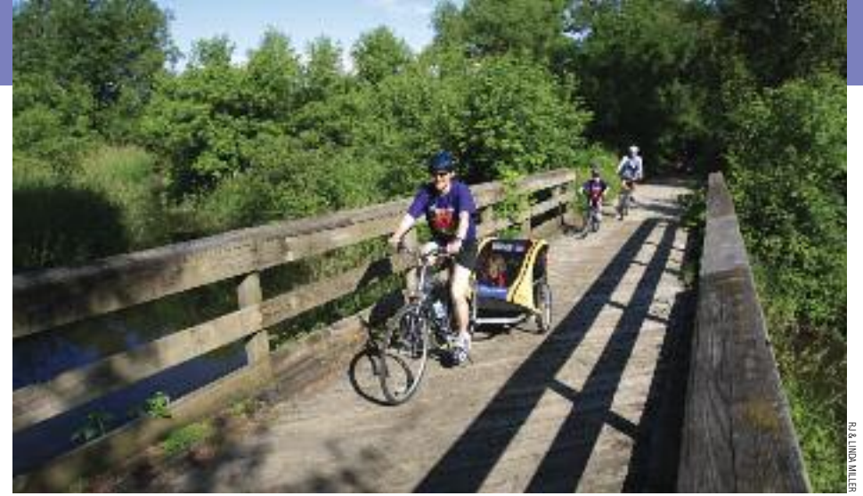
Great River State Trail, near Onalaska.