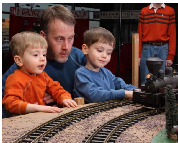
Mad City Model Railroad Show