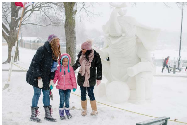
Phillips Winterfest