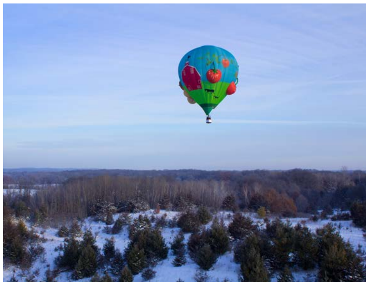
Hudson Hot Air Affair