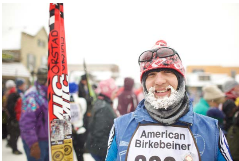
American Birkebeiner