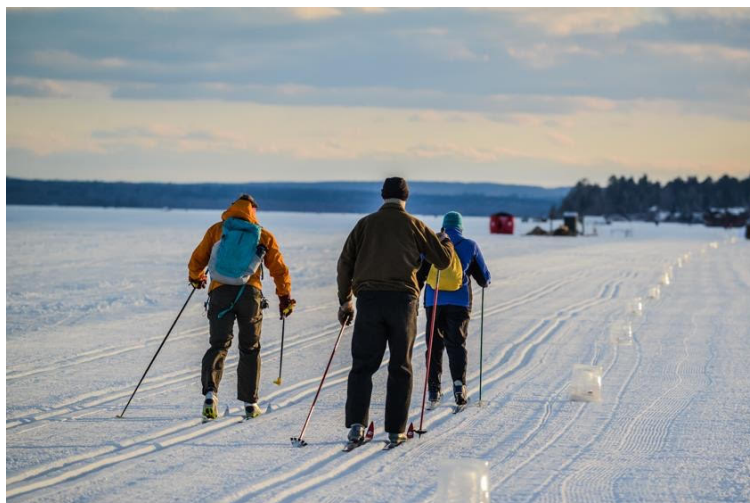
Book Across the Bay