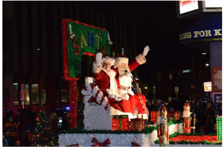
Downtown Appleton Christmas Parade