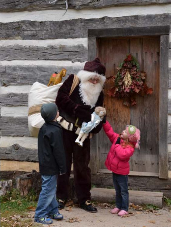
Old World Christmas