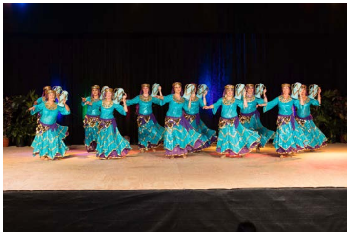
Holiday Folk Fair International